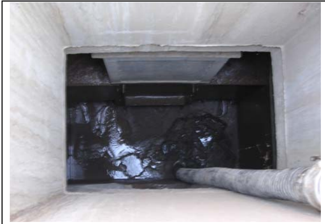
A view of the unit being cleaned

PO Box 6086 Alexandria NSW 2015 Phone: +61 2 9669 6000 Fax: +61 2 9669 6100 Email: info@ecosol.com.au Website: www.ecosol.com.au