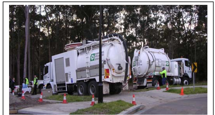
A view of the eductor truck

For further information on Ecosol's maintenance and cleaning services, please contact our NSW office on 02 9669 6000.